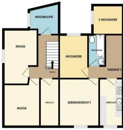
2ND FLOOR 749 sq. ft. (69.6 sq. m.) approx.

Whilst every attempt has been made to ensure the accuracy of the floorplan contained here, measurements of doors, windows, rooms and any other items are approximate and no responsibility is taken for any omission or mis-statement. This plan is for illustrative purposes only and should be used as such by any prospective purchaser. The services, systems and appliances shown have not been tested and no guarantee as to their operability or efficiency can be given. Made with Metropix ©2023