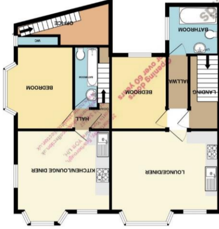
1ST FLOOR 791 sq. ft. (73.5 sq. m.) approx.